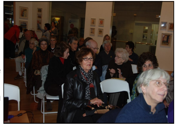
Audience listens to speaker, Mandell JCC