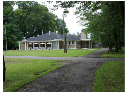
Keney Park, 2010

For answers to these questions and many more, join us on a tour this fall. We look forward to seeing you!