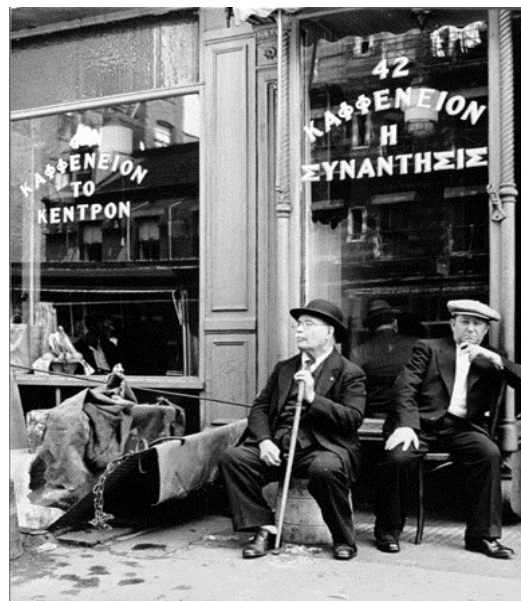
Greek coffee house, Allen Street c.1910

Among the millions of immigrants who came to the shores of the United States from 1881-1924, was a small group of Greek-speaking Jews, a true minority within a minority. Learn about this fascinating community, what life was like for them on the Lower East Side and why, while hundreds of early synagogues closed their doors, Kehila Kedosha Janina, the synagogue they founded in 1927, is still open and functioning as a Jewish house of worship.